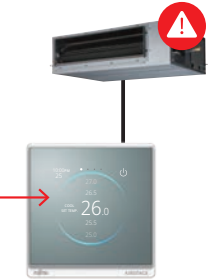
Wired remote controller