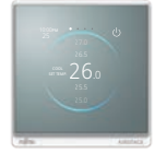
Wired remote controller